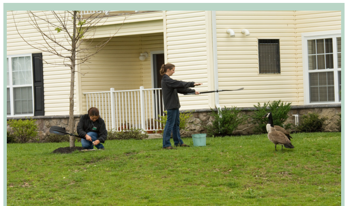
Nest Management is Best Done by a Team of Two People-- One To Treat The Eggs and One To Keep The Geese Away From The Nest

Nest defense behavior by Canada geese is encountered after the nest is located and during the process of moving the adult goose off the nest. Geese must be moved to effectively treat the eggs.